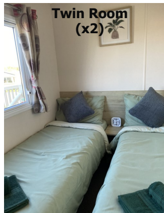
Twin Room (x2)