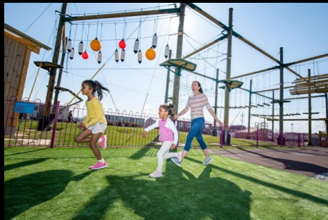
High Ropes Course