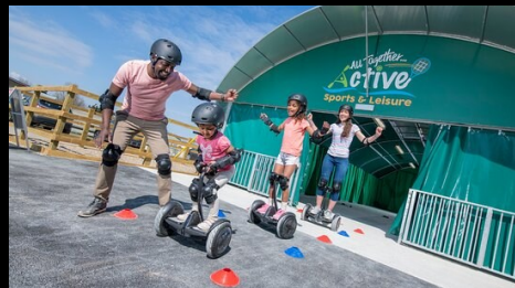
The Sports Dome