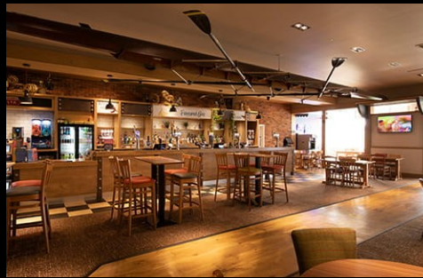
The Boat House Restaurant and Bar