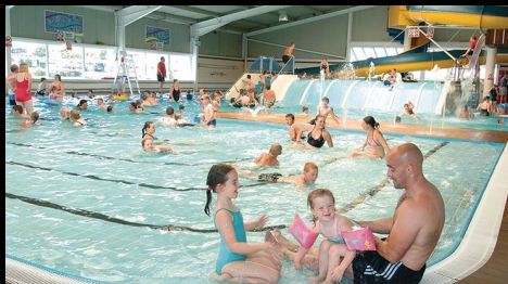
Indoor Pool and Slides

Situated on the Parkdean Cayton Bay Holiday Park, a short car journey from Filey and Scarborough